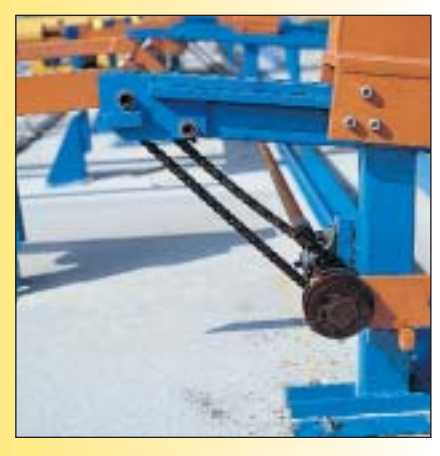
Receiver stand with automatic indexing