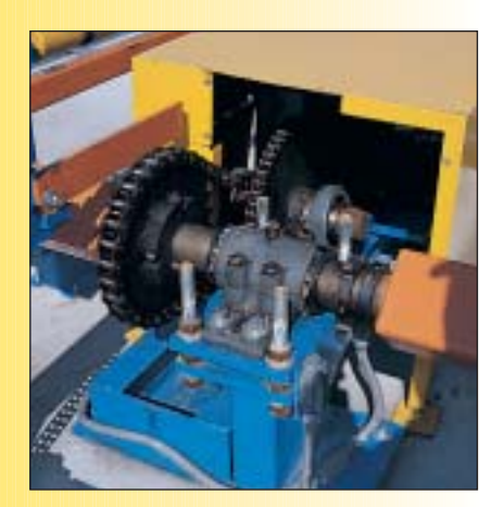
Heavy-duty drive system